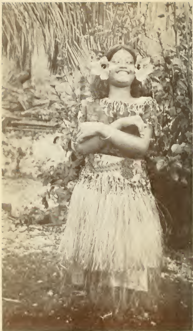
With Hibiscus in her hair