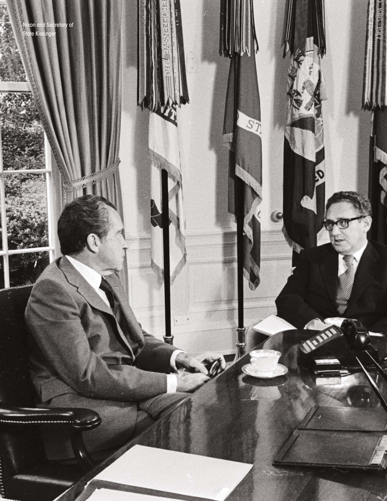
Nixon and Secretary of State Kissinger