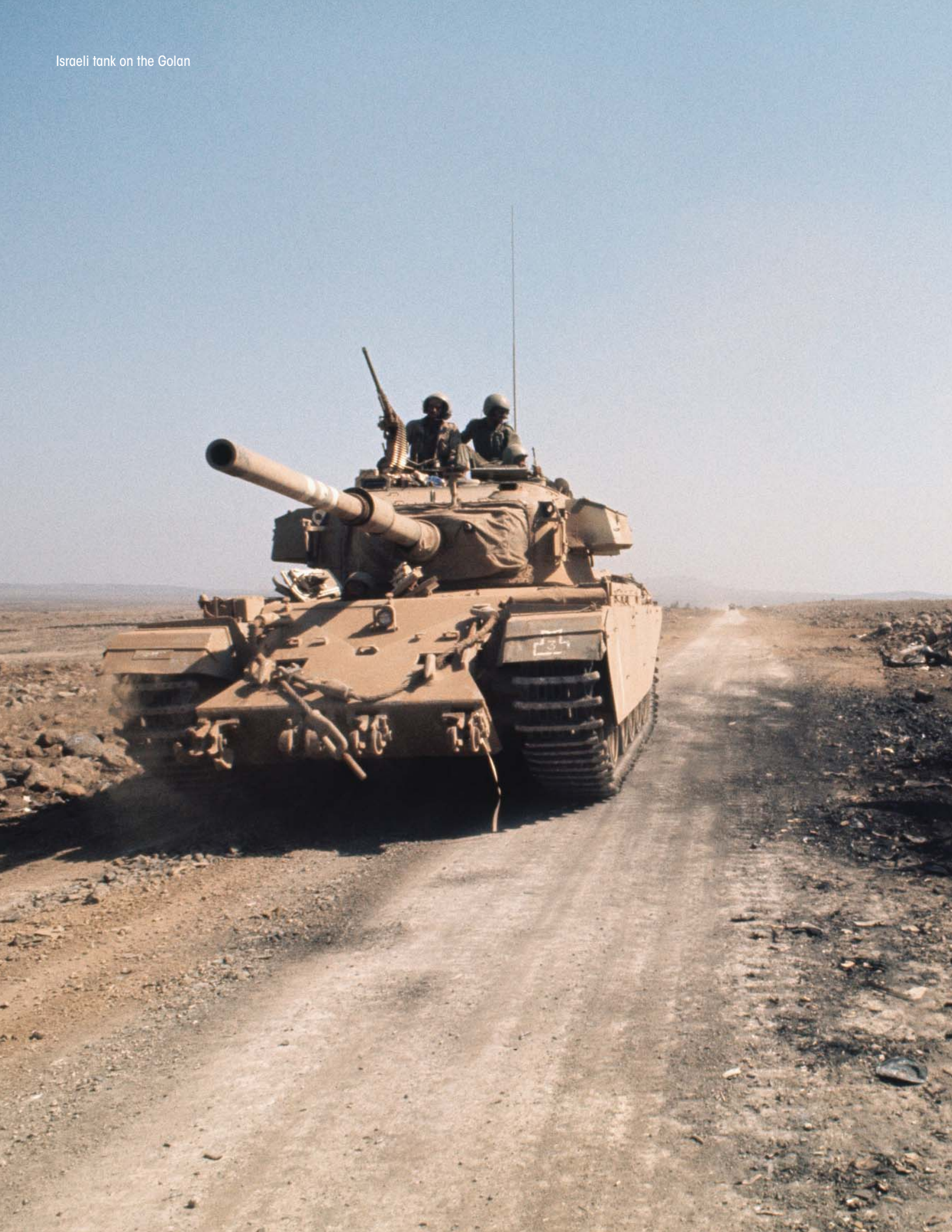
Israeli tank on the Golan