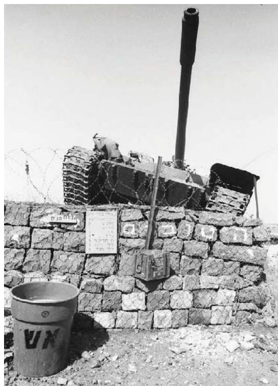
LEFT: Destroyed Syrian tank on the Golan Heights