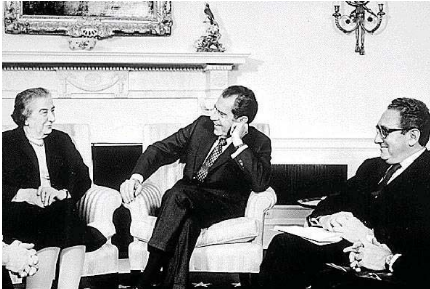
BOTTOM: President Nixon meeting with Arab Foreign Ministers at the White House, 17 October 1973