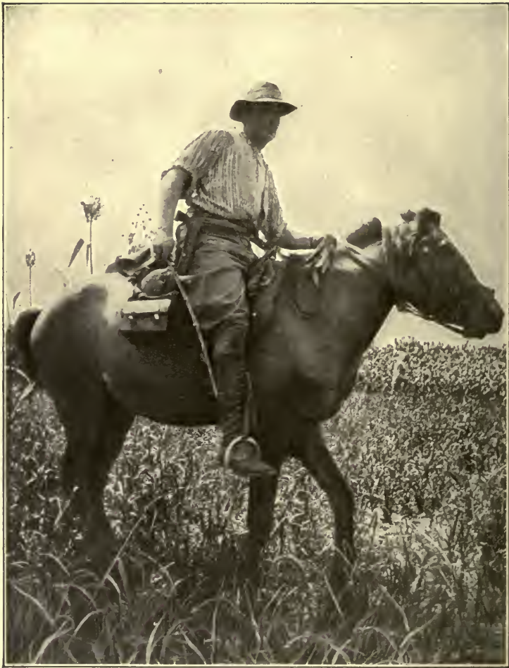
At the front in Manchuria