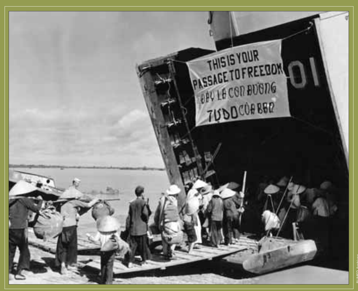
Refugees from North Vietnam board a U.S. Navy landing craft that will transport them to a new life in South Vietnam.