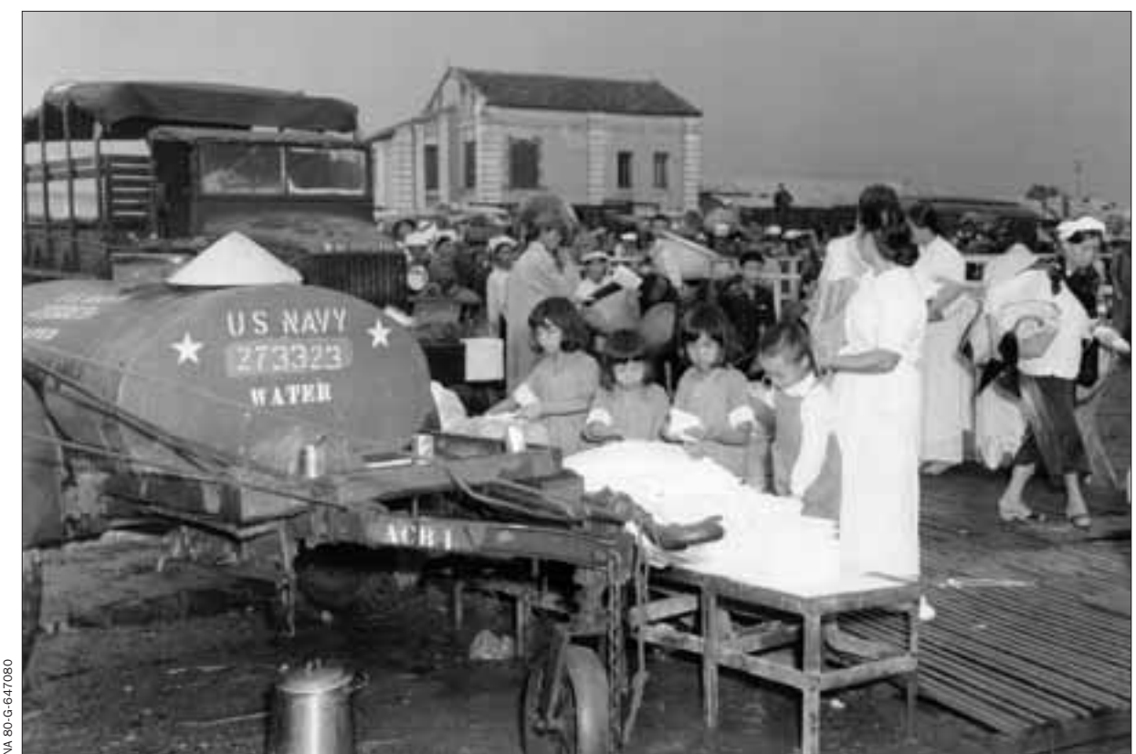
Orphans fold sheets at a Haiphong refugee camp, 1954.

Despite this retrograde movement in Navy medical personnel and facilities, the Cold War continued. Indochina replaced Korea as the number one hot spot. When French colonial rule in Indochina came to a chaotic end in 1954, following the climactic defeat at Dien Bien Phu, the U.S. Navy helped evacuate 721 French troops and transport them back to their homes in France and North Africa. These pitiful soldiers suffered not only from wounds but also from a variety of jungle diseases and malnutrition. The hospital ship Haven (AH 12), which had already seen action in World War II and four tours during the Korean War, was again pressed into service for the trip. When one of the Legionnaires died en route,