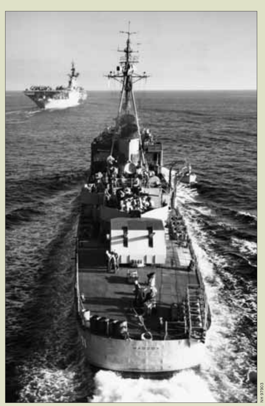
In this 1953 photograph, U.S. destroyer Maddox steams astern of carrier Philippine Sea (CV 47).

Eventually, the skipper came on the 1MC and said he thought the sound the sonar man was picking up was the sound of our rudder as we moved through the water, and we were breaking off action. [While