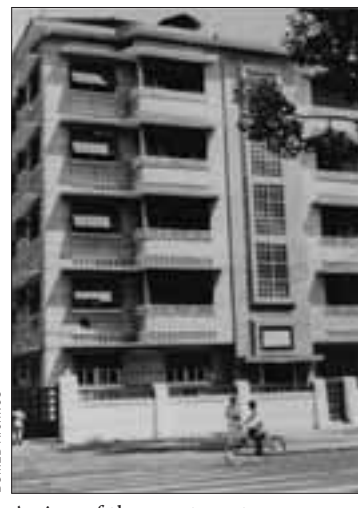
A view of the apartment house that would become Station Hospital Saigon.

The five-story, concrete building, located on Tran Hung Dao, downtown Saigon's busiest street, was the Navy's only hospital—from the day it opened—to receive American combat casualties directly from the field. And it especially filled the need for an inpatient facility in the southern portion of South Vietnam, a demand precipitated by the fighting in the Mekong River Delta area. The only other