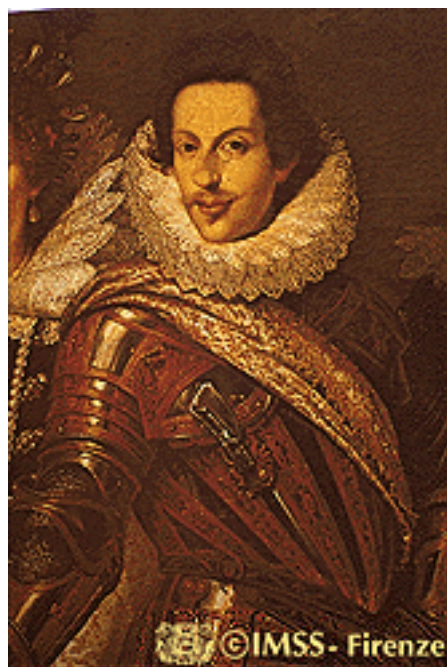
Figure 6: Cosimo II

Cosimo's son, Ferdinand II (1610-1670) was just ten years old when he became Grand Duke, and until