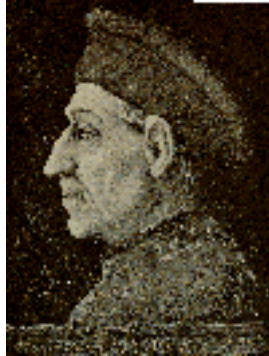
Figure 2: Cosimo il Vecchio

Cosimo spent a considerably part of his huge wealth on charitable acts, live simply, and cultivated literature and the arts. He amassed the largest library in Europe, brought in many Greek sources, including the works of Plato, from Constantinople, founded the Platonic Academy and patronized Marsilio Ficino, who later issued the first Latin edition of the collected works of Plato. The artists supported by Cosimo included Ghiberti, Brunelleschi, Donatello, Alberti, Fra Angelico, and Ucello. During his rule and that of his sons and grandson, Florence became the cultural center of Europe and the cradle of the new Humanism. Cosimo's son Piero (1416-1469) ruled for just a few years but continued his father's policies while enjoying the support of the populace.