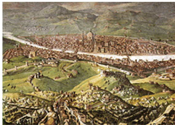
Figure 1: Florence

Tuscany is located in the western part of the boot of Italy (Section ), north of Rome and south of Genoa. It is bounded by the Apennines to the North and East and by the Mediterranean on the West. Its land area is about 9,000 square miles. Its major cities are Florence, Pisa, Siena, Lucca, Arezzo, and Pistoia. Its major river is the Arno, on which Florence and Pisa are located.