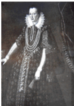
Figure 5: Christina of Lorraine