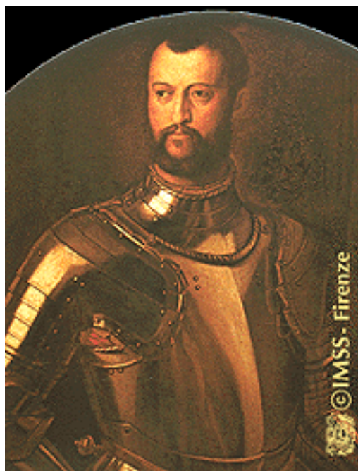
Figure 3: Cosimo I

In 1569 Cosimo was named Grand Duke of Tuscany. He set the style for the new absolute rule by concentrating the administration of Florence in a new office building, the Uffizi (where he also began a small museum for art works; the entire Uffizi is now a museum), and moving his residence across the river to the Pitti Palace, bought in 1549 and enlarged and remodeled several times by Cosimo and his descendants. He built a private corridor between the Pitti Palace and the Palazzo Vecchio in the city, where the government met. Vincenzo Galilei 9 moved his family, including the ten-year old Galileo, from Pisa to Florence in the year of Cosimo's death.