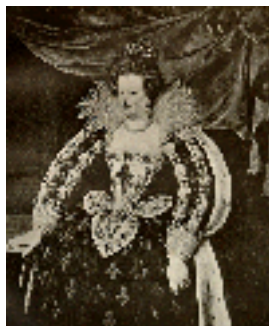
Figure 8: Maria (Marie), Queen of France

The Medici family dominated Florentine politics for two and a half centuries and presided over a cultural achievement that is equalled only by Athens in the golden age. The family also got its genes mixed with those of most royal families in Europe. Medici women included Catherine (1519-1589) who married Henry II, King of France and ruled the country after her husband's death; Maria (1573-1642) married Henry IV, King of France. Maria's daughters became queens of Spain and England. Cosimo II's wife, Maria Magdalena, was the sister of Ferdinand II, Holy Roman Emperor.