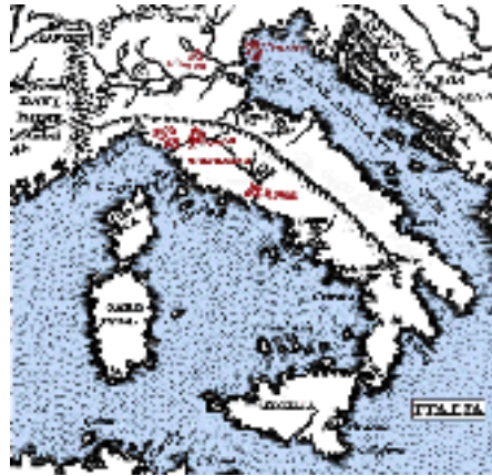
Figure 1: Italy 2 Map of Italy 3

After the fall of the Roman Empire, the peninsula of Italy was not again politically unified until the nineteenth century. The region emerged from the so-called Dark Ages as an unorganized group of city states. Historically the most important of these were Venice (wealthy because of its trade with the Middle East) and Milan (an important manufacturing center) in the North, Florence (Section) (a center of commerce and manufacturing) and the Papal States in the center, and Naples and Sicily in the South. There were also many smaller and less important city states, such as Mantua, Genoa, and Verona.