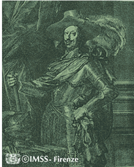
Figure 7: Ferdinand II

his majority the government was carried on by the two Grand Duchesses, Cosimo's mother Christina of Lorraine, and Cosimo's wife, Maria Magdalena of Austria, the sister of the Holy Roman Emperor Ferdinand II.