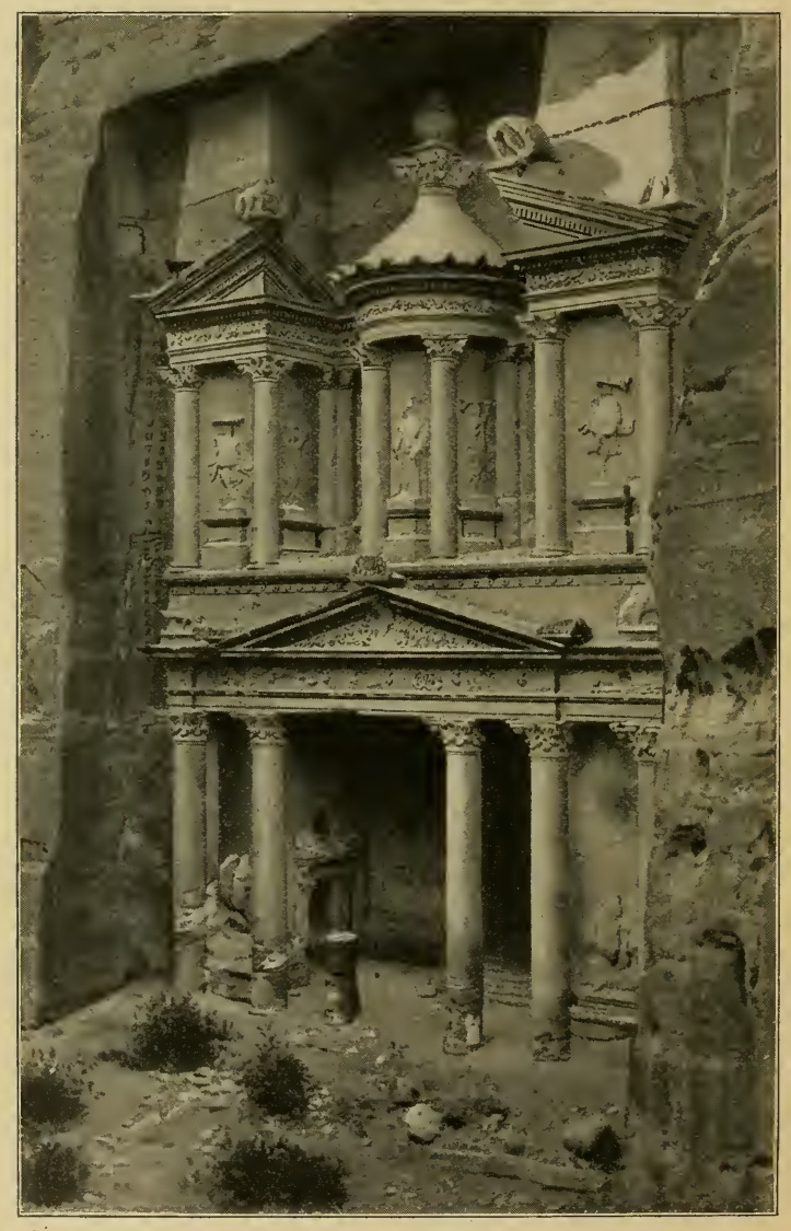
A ROCK-CUT TEMPLE OR SHRINE AT PETRA, IN ANCIENT EDOM Petra was the chief station on the great caravan route from Babylonia to Gaza and the cities of Phœnicia.