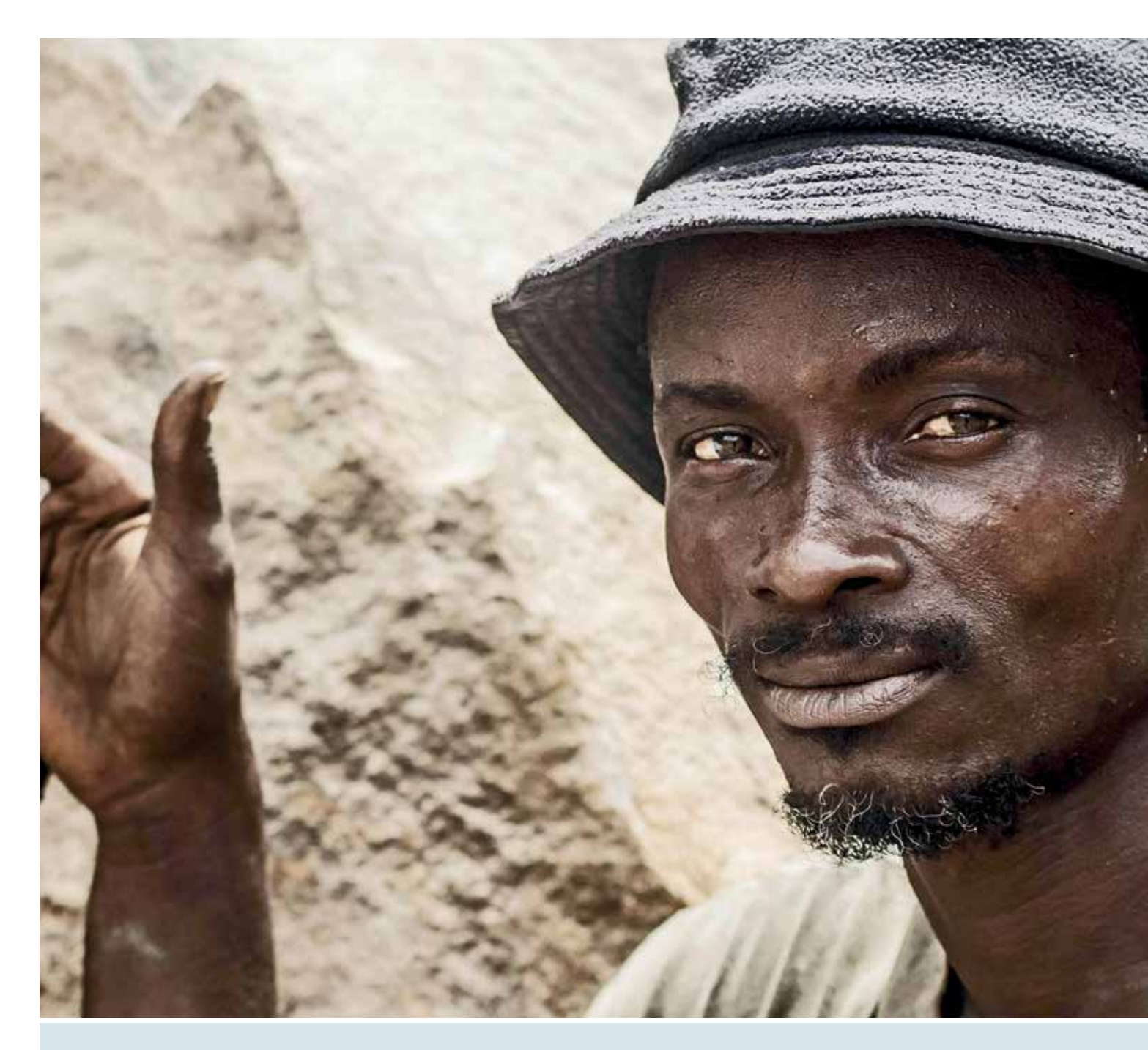
\textbf{Sierra Leone.}

This is important because mental health is crucial to the overall well-being, functioning, and resilience of individuals, societies, and countries recovering from natural disasters, armed conflicts, or other hazards.