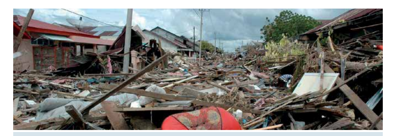
Indonesia (Aceh).

Countries faced with emergencies should not miss the chance to use available political will for change and to initiate mental health reform.