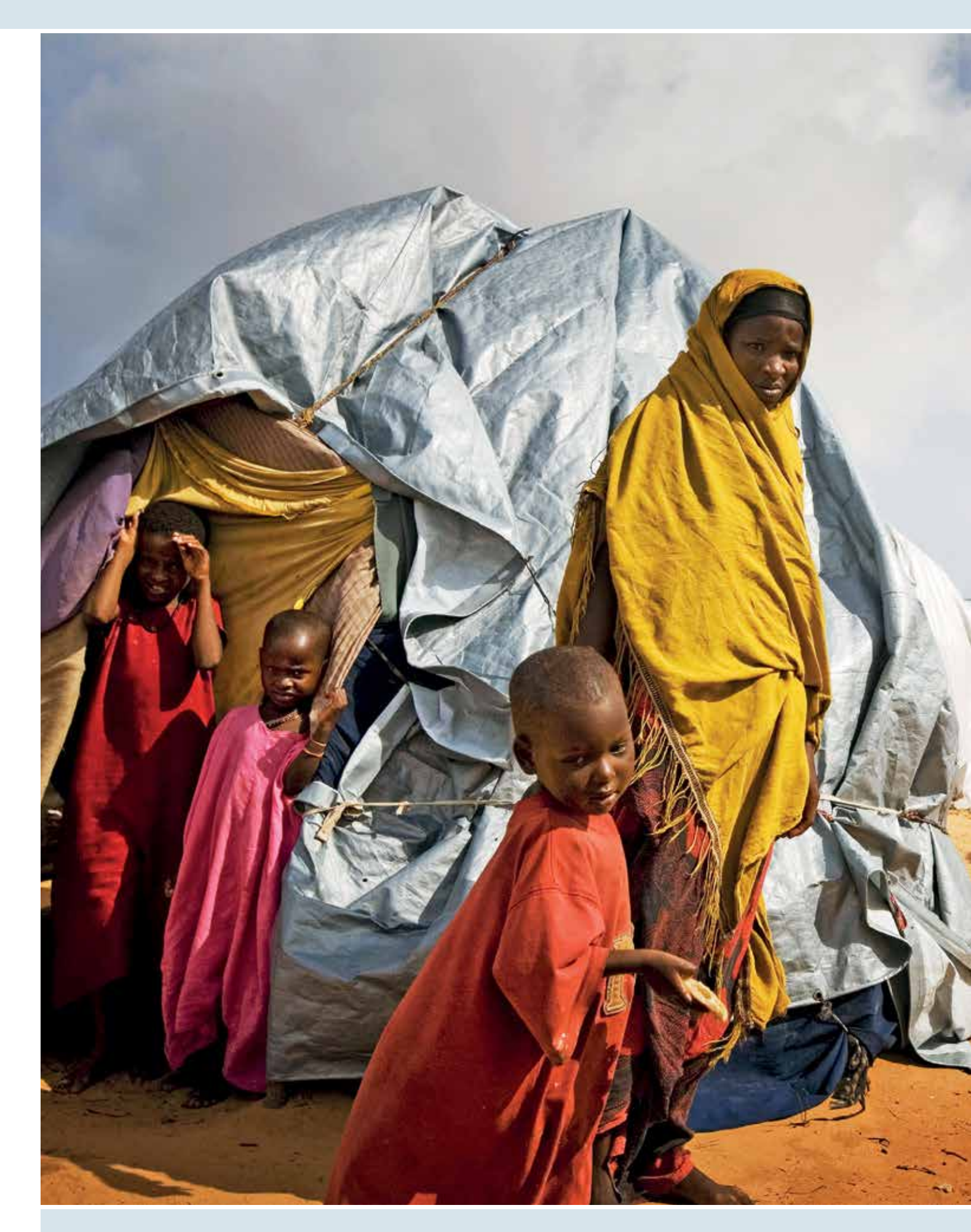
\textbf{Somalia.} \ \textcircled{\o} \ \ \text{Kate Holt/IRIN.} \ \ \text{Reprinted with permission}.